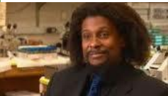
Dr. Tyrone Hayes

Dr. Tyrone Hayes, professor of Integrative Biology at UC Berkeley, shared some of his extraordinary research on am-