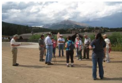
PEC Conference participants near Allenspark, Colorado.

So perhaps the conference altered my thinking and my trust in hope. Hope is less abstract, more communal, more focused in these earthy, fun, prophetic saints who came to Colorado. And so courage brothers and sisters! Courage to fight the good fight on behalf of each other and the earth, courage to speak the truth in love, and courage to trust in God's spirit of creativity whose trajectory of grace pulls us into the deep future. We indeed are privileged to know what we know, thanks to each other, and the grace of God that flows through us. Now that we have this knowledge, we must act. And remember this: In this time in which we are privileged to live, on the cusp of great transformation, the prophetic is pastoral.